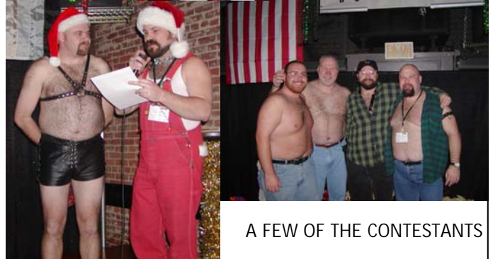
A FEW OF THE CONTESTANTS