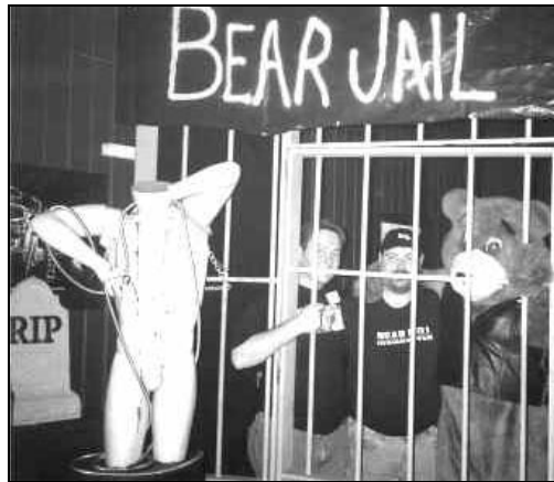
The BEAR JAIL with BEAR Prisoners.