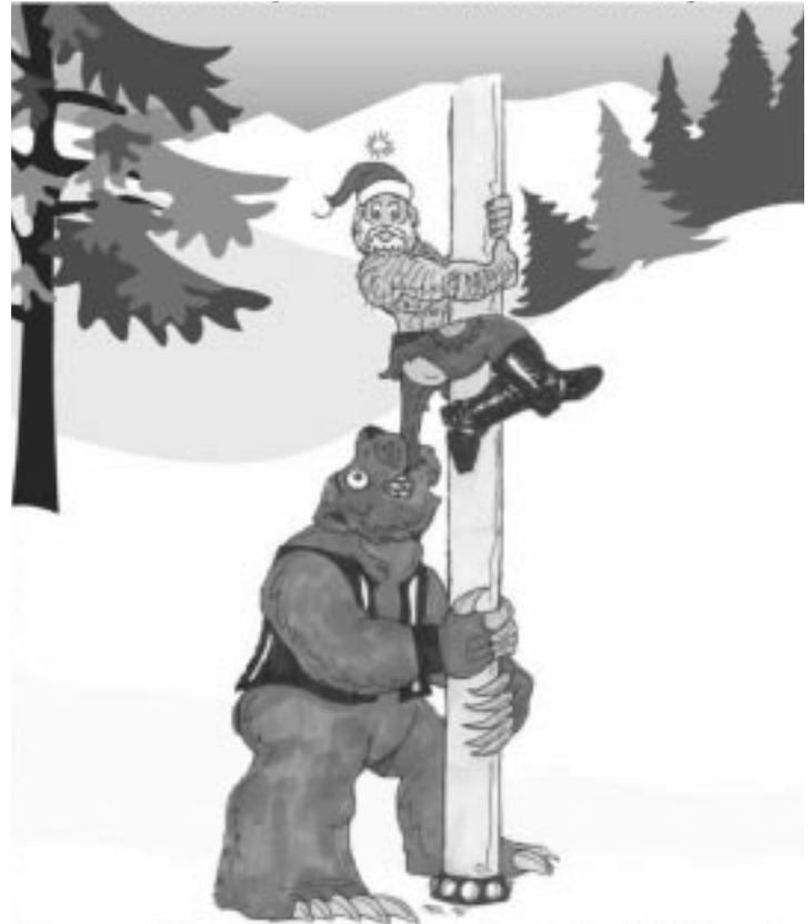
There won't be another like this one for another 1,000 years!

The Renaissance Tower Historic Inn (the host hotel) is already full but they get cancellations sometimes. You can call them direct at (317) 261-1652. Otherwise we have made arrangements with the Days Inn at 401 E. Washington to handle the overflow. Their room rate is only $55.00 per night. Their phone number is (317) 637-6464.