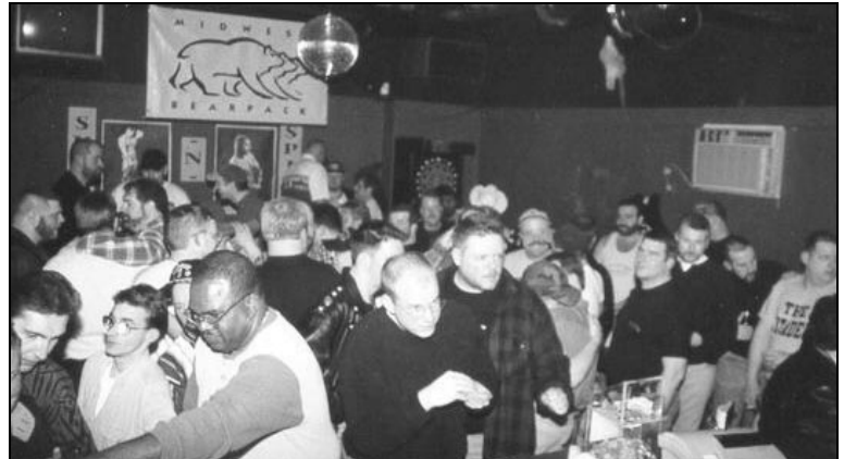
The Bear Awakening 1999 crowd scene at DJ's Saloon.