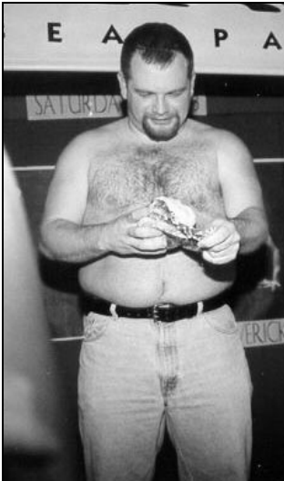
“What the heck????”